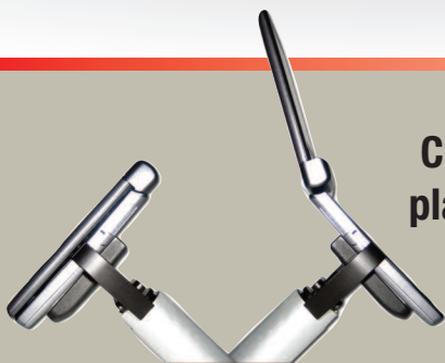
Attractive Display MOUNTS

Choose from aluminum or plastic, WALL or COUNTER MOUNTS