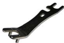
Removal Tool 125215