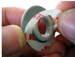
2. Remove the 3M tape backing