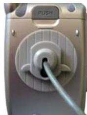
10. Place on the rear of the phone ensuring the two wing are at the 9 and 3 o'clock position.