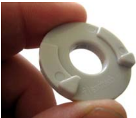
1. Turn the sureMOUNT over.

If you require to retrofit existing displays there are many add-ons that can be implemented to help make this solution work.