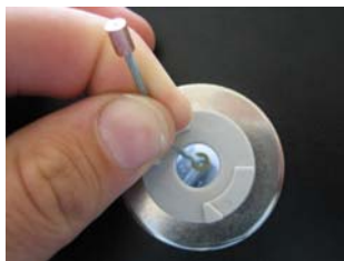
5. Pull the cable through the sureMOUNT.