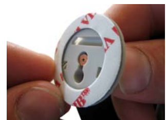
8. Place the 3M tape ring onto the bottom of the pad.