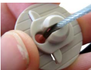
7. Bring the cable over to the slot and then pull up.