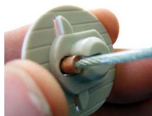
6. Place the copper stop into the hole on top of the pad.