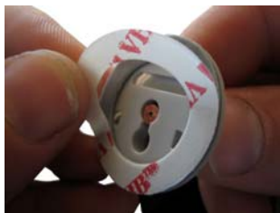
9. Remove the tape backing from the tape ring.