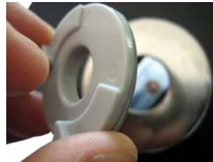
3. Place sureMOUNT over the 3/4" hole.